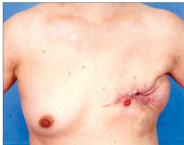
Figure 1: Recurrent cystosarcoma phyllodes

transversely was found adherent to the chest wall, invading the skin, ribs and pleura. The thoracic surgeon resected the entire left anterolateral chest wall from the midsternum to the midaxillary line, comprising skin,