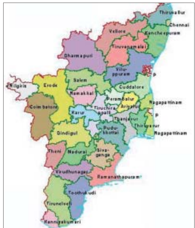
Figure 1: Districts of Tamil Nadu, India