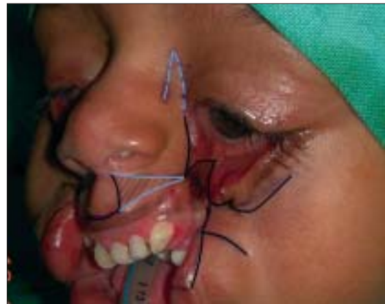
Figure 3b: Incision markings described as in Figure 3a. Sometimes, following medial canthopexy, an inferiorly based transposition flap (dotted grey line) from high up in the lateral side of the nose may be required to fill the defect below the lower lid. The shaded area lateral to the philtral column is required to be excised