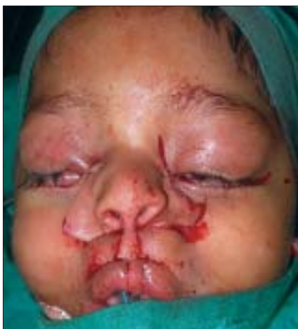
Figure 5d: Repair of B/L Tessier cleft type-4 after medial canthopexy & upper lip repair and after application of key stitches