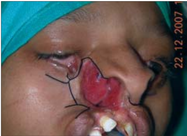
Figure 4a: Markings for the management of the nasomalar component in case of Tessier cleft type-3. See most of the lateral wall of nose (lining) was created by the turn-in flap of cheek tissue which is stitched with a turn-in flap of the lateral nose & alar skin

In Type-4 cleft the inferior canaliculi (starting from the inferior punctum, which is lateral to the cleft) ends in the blind maxillary sinus through a lateral duct without connecting to the nasal cavity. This " lateral lacrimal duct " was incised below and united to the " medial lacrimal duct " (starting from the superior punctum, which is medial to the cleft) that opens into the nose [Figure 5b]. (This step is not required/possible in Tessier cleft type-3 because the cleft, in that case, actually passes through this important area effacing the entire lacrimal system beyond recognition. In type-4 cleft cases, direct closure of the remaining defect is accomplished after adroit and ingenious tailoring. The