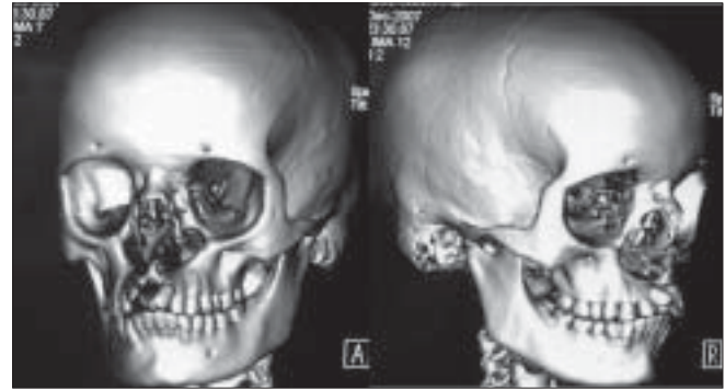
Figure 1b: 3-D CT scan of the same type-3 cleft patient showing severely hypoplastic nasal bone and maintained infra-orbital rim & orbital floor supporting the globe

As in the classical description of Type-4 cleft by Paul Tessier, the cleft starts lateral to the Cupid's bow (more lateral than type-3), ascends upwards lateral to the nose, ending