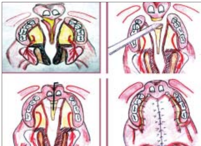
Figure 3A: Diagram for pre-maxillary setback with palate repair