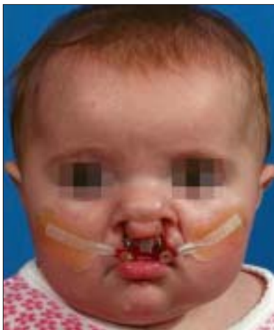
Figure 3: (C) The bilateral NAM plate in position showing the tape adhered to the prolabium and stretched to the plate and attached to the plate