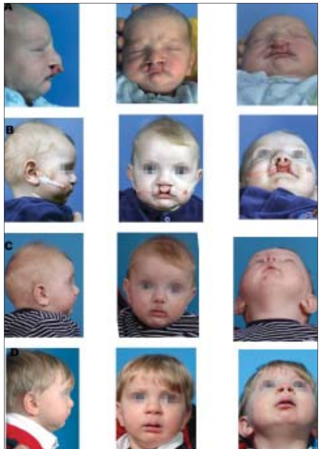
Figure 4: A bilateral complete cleft lip and palate infant treated with NAM therapy. (A) Prenasoalveolar moulding therapy, (B) post-nasoalveolar moulding therapy. Note the non-surgical columella elongation, (C) post-surgical photograph, (D) 1-year follow-up