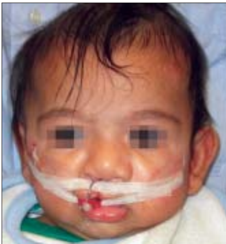
Figure 3: (B) Unilateral NAM plate with a nasal stent showing lip taping.

In bilateral cases, there is a need for two retention arms as well as two nasal stents which are similar in shape to the unilateral stent. After adding the nasal stents in the bilateral cleft, the attention is focused on non-surgical lengthening of the columella. To achieve this objective, a horizontal band of the denture material is added to join the left and right lower lobes of the nasal stent,