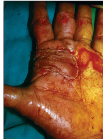
Figure 2: Post-surgery