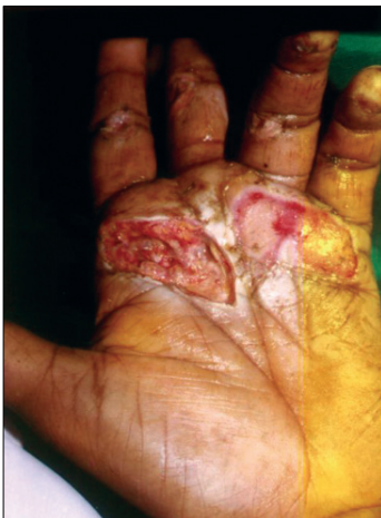
Figure 1: Palmar defect before surgery

In our series of five patients, we have grafted the donor defect as well as the pedicle of the flap in two out of five patients, and in these two patients flaps survived completely.