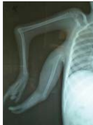
Figure 4: X-ray picture