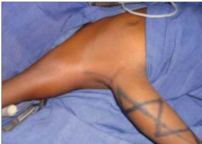
Figure 5: Zig-zag incision marking over the inferior limb