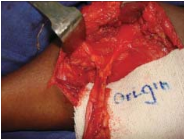
Figure 7: Dissection of pedicle upto its anomolous origin in infra-clavicular region from subclavian artery