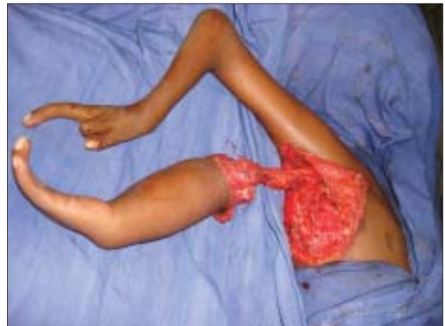
Figure 6: Encircling incision placed around the inferior limb

ray including the 3 rd metacarpal was absent. The inferior limb had two fingers and a single bone with which it was attached to the chest wall. Clinically, the superior limb presented a picture of an ulnar hypoplastic hand where