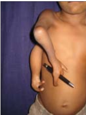
Figure 3: Pre-operative picture showing hand function