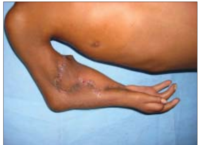
Figure 10: Post-operative picture