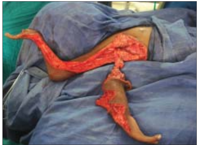
Figure 8: Zig-zag incisions on corresponding sides of both limbs