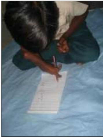
Figure 13 A : Post -op. photograph showing hand function