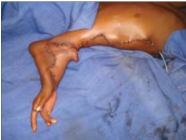
Figure 9: Transfer of inferior limb along the superior limb with creation of the hand