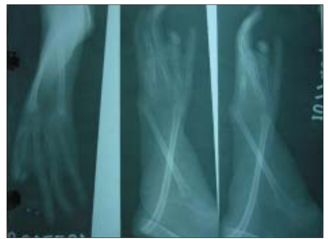
Figure 12: post-op. X-ray picture