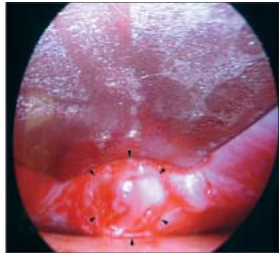
Figure 4: Endoscopic view of the lipoma (arrows)