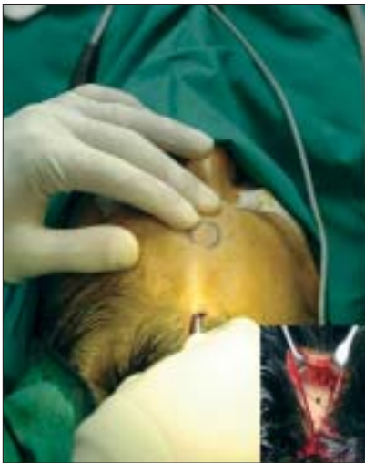
Figure 3: Subperiosteal plane revealing periosteal layer (^) (above) and calvarium (*) (below)