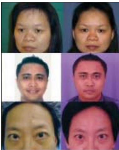
Figure 5: Pre- and postoperative photographs

Due to prior local anaesthetic infiltration, minimal dissection is required to free the lump from the surrounding tissues. The lipoma is easily removed by “pushing and pulling”, which is, finger pressure on the outside coupled with dissection and traction from the inside.