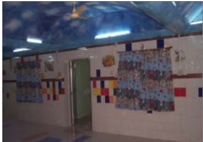
Figure 4: Renovated pediatric ward with cartoon murals and ceiling with sky effect

As our patients tended to come from very low socioeconomic strata of society, their untreated deformities were sometimes due to lack of awareness and sometimes due to poverty. To address this financial problem, the whole process was made absolutely free for the patients. The NGO paid for all the necessary awareness