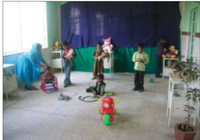
Figure 5: Separate playroom with toys for children