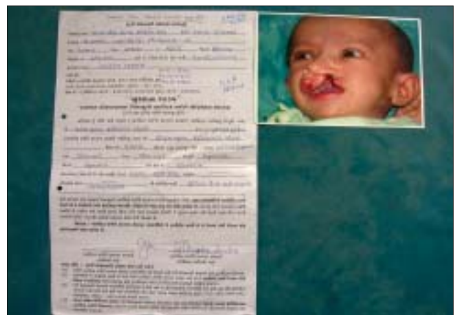
Figure 3: Application form with photograph of the patient

Posters and pamphlets were created in the local language with preoperative and postoperative photos of patients and were distributed at the Panchayat (village level elected council) offices, schools and dairy offices [Figure 1]. Booklets were created with short stories and photographs of patients describing the vast improvement in the quality of life after surgery [Figure 2]. These booklets were also distributed during festive seasons such as Navratri (An important festival in India and particularly in the state of Gujarat) to further increase awareness. Due to the increased awareness, we started getting patients from villages and tribal areas.