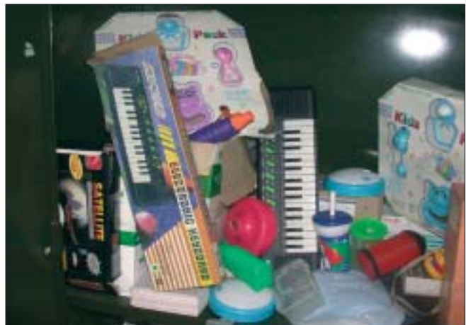
Figure 6: Toy bank in pediatric ward

campaigns, transportation of patients with their attendants, investigations, medications, postoperative splints, and pressure garments including their expenses for follow-up visits. Hence, Project Muskan is a truly