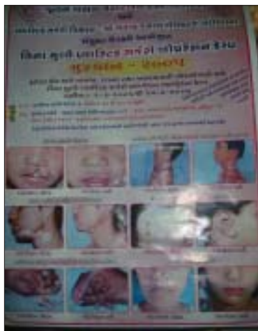
Figure 1: Poster in local language for awareness creation