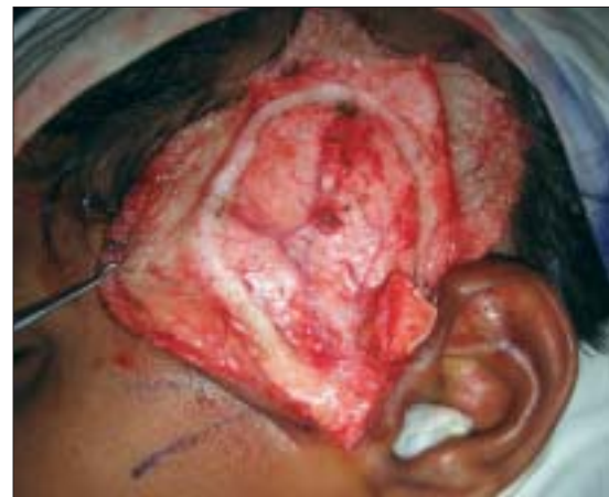
Figure 4: Photo showing harvested cartilage with cuff of TPF