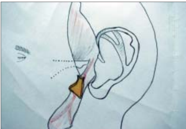
Figure 5: Diagram of composite flap showing vascularised cartilage and TPF, based on the STA