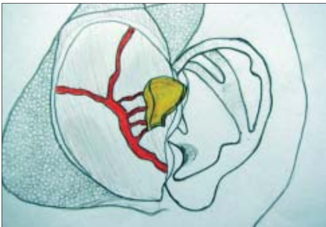
Figure 3: Diagram of harvested cartilage with cuff of TPF prior to harvesting