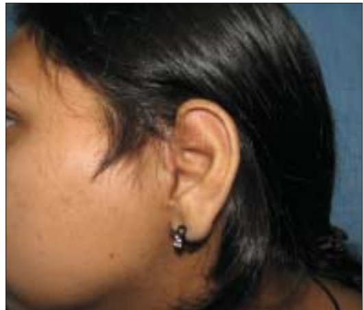
Figure 12: Minimal donor morbidity at the root of the helix

However, interposition arthroplasty appears to be the mainstay of treatment and various materials have been used. Acrylic, [9,10] dermis fat graft, [11] muscle or myofascial flaps, [12] auricular cartilage (nonvascularized), [13] resected