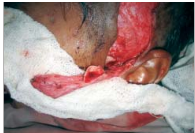
Figure 6: Photo showing composite flap consisting of harvested cartilage and TPF

of five cases, they showed adequate mouth opening after one year, and postulated that the disorganized fibrous tissue in the gap was compressed into an organized layer, simulating the disc of the joint.