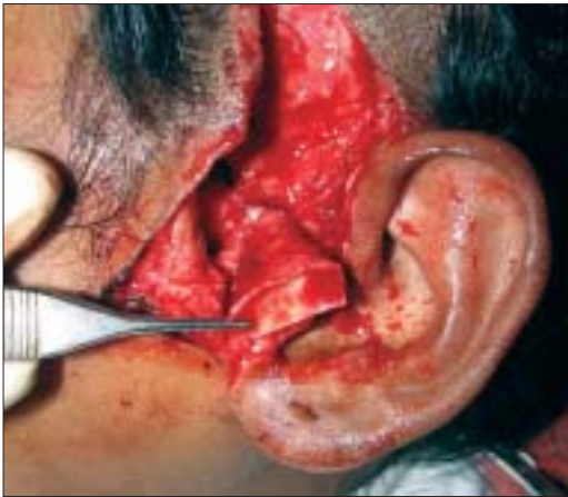
Figure 7: Excellent bleeding from the cartilage