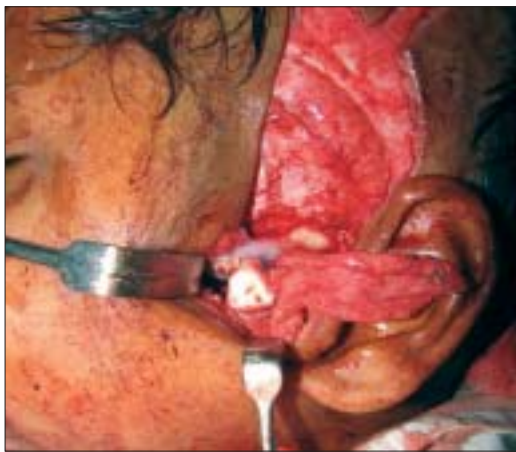
Figure 9: Photo showing the cartilage lining the glenoid, retained with fibrin glue and sutures, with the costochondral graft in place, showing the formation of the joint