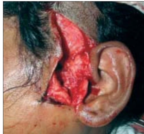
Figure 2: Initial dissection to harvest cartilage preserving branches to helical root