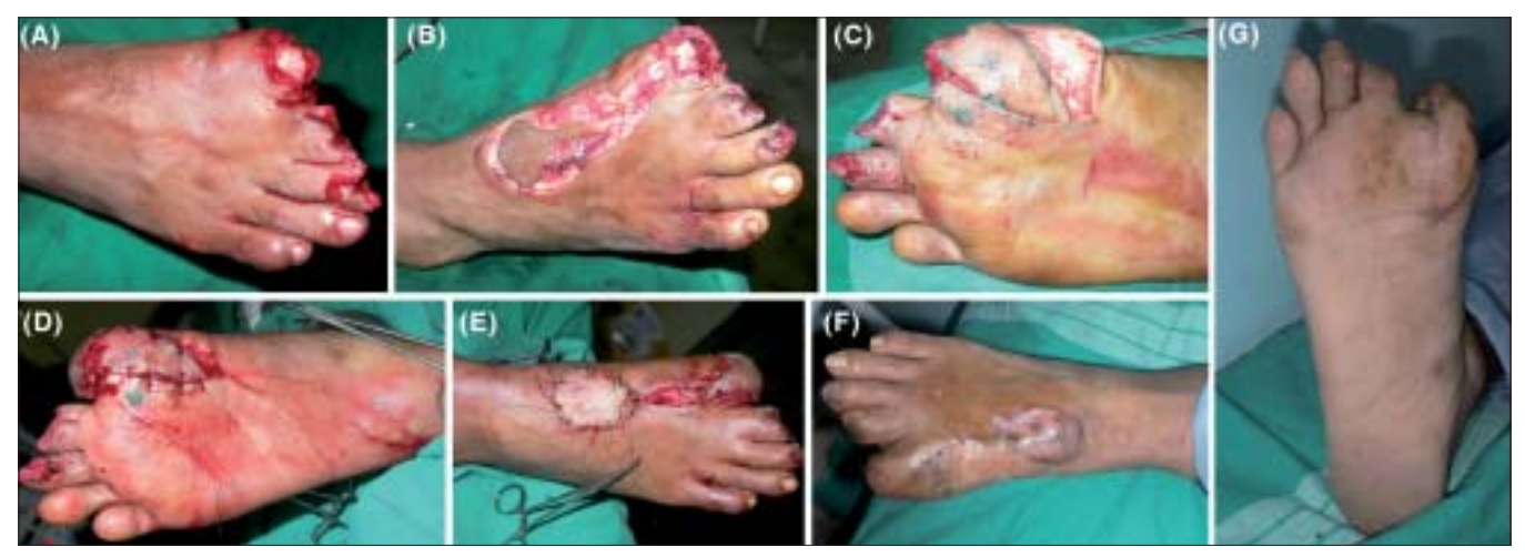
Figure 2: (A) 40/M with defect over great toe. (B) Reverse FDMA flap being elevated. (C) Plantar V-Y advancement. (D) After closure Plantar aspect. (E) Dorsum of foot after graft application. (F) Dorsum: well-settled flap. (G) Plantar aspect: well-settled flap