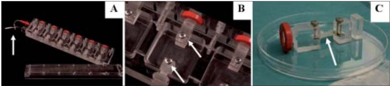
Figure 1: Bioreactor. We developed a bioreactor able to reproduce a cyclic mechanical stretching onto cell-seeded biomaterials (A). White arrow in (A) points at the electrical connection, in (B) shows a detail of biomaterial anchoring system and in (C) points at stretched biomaterial