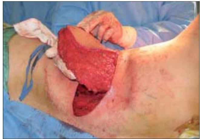
Figure 3: The muscle with the overlying fat after being harvested and transferred to the chest wall. As much fat as possible should be harvested