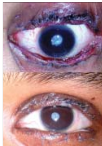
Figure 3: Immediate postop picture (top) and two weeks follow-up picture (bottom) showing good healing of lid margin