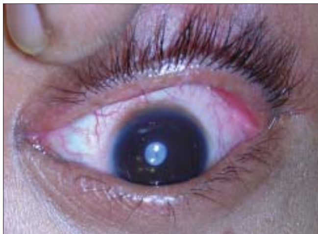
Figure 1: Photograph of the left eye showing distichiasis eyelashes in contact with the conjunctiva and the cornea