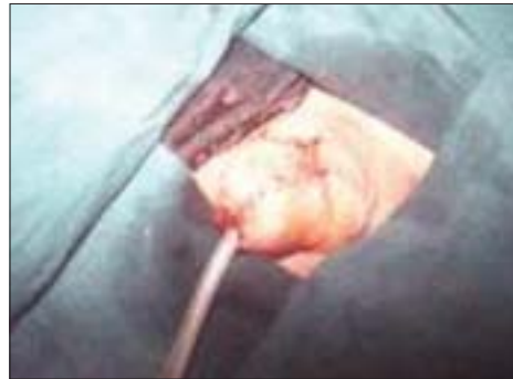
Figure 13: Good cosmetic appearance, conical shaped glans, after [TIP]