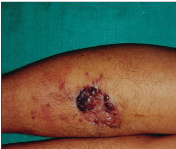
Figure 1: Ulcer with bluish red macules on anterior aspect of leg with multiple small and similar lesions seen distally

Pseudo Kaposi's sarcoma, also called Mali's disease or acroangiokeratosis has been described as unilateral, subacute to chronic dermatitis, often with postinflammatory hyper-pigmentation occurring in amputees with poorly fitting appliances, in A-V fistulas, venous hypertension etc. [Figure 3]. These lesions may closely resemble Kaposi's sarcoma both clinically and