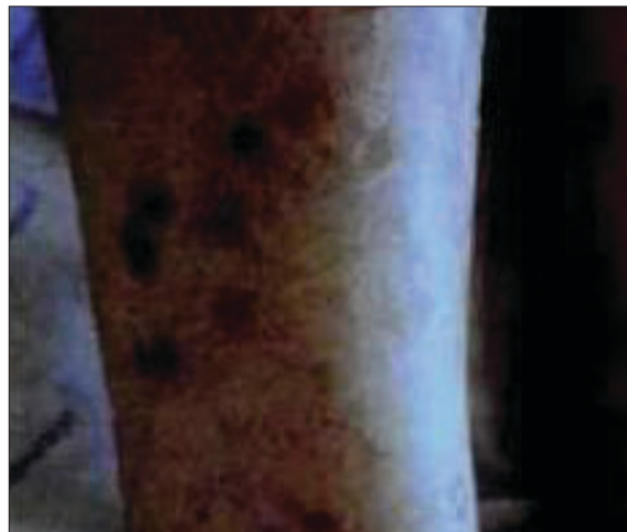
Figure 3: Clinical photograph of pseudo kaposi's sarcoma of leg