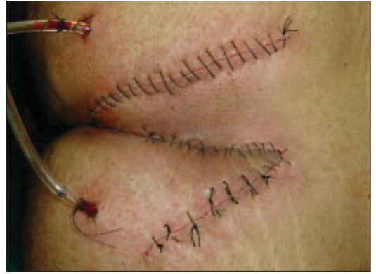
Figure 7: Postoperative picture after one week