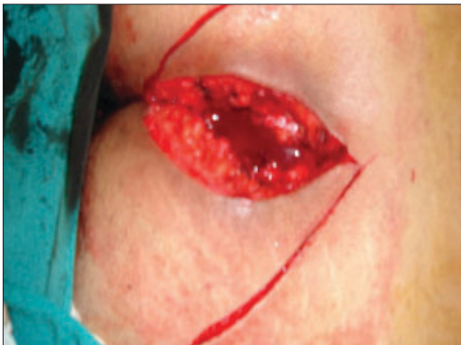
Figure 5: Eccentric excision and N shaped