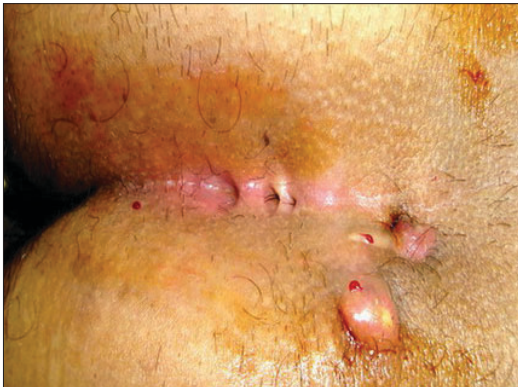
Figure 4: Multiple sinuses