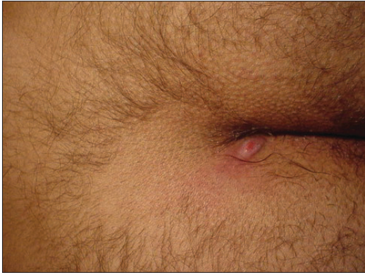
Figure 3: single sidewall pilonidal cyst