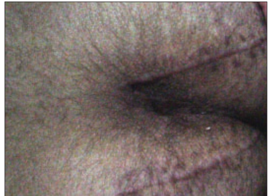
Figure 8: after 2 years