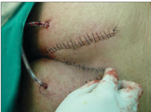
Figure 6: Intraoperative picture