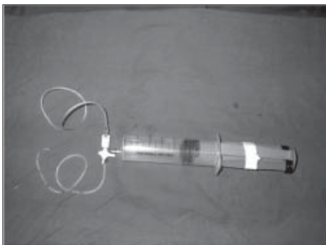
Figure 3: Equipment for the modified syringe suction drainage system: two infant feeding tubes, three-way cannula, 20/50 cc syringe, and two 10 cc pistons

need closed suction drainage (as described above) are Dupuytren's Contracture, Tendon transfers, concomitant bone harvesting from upper end of ulna and lower end of radius etc. However we do not recommend this method if one of the wounds is infected or potentially infected, for the fear of theoretical possibility of contaminating the non infected wound.