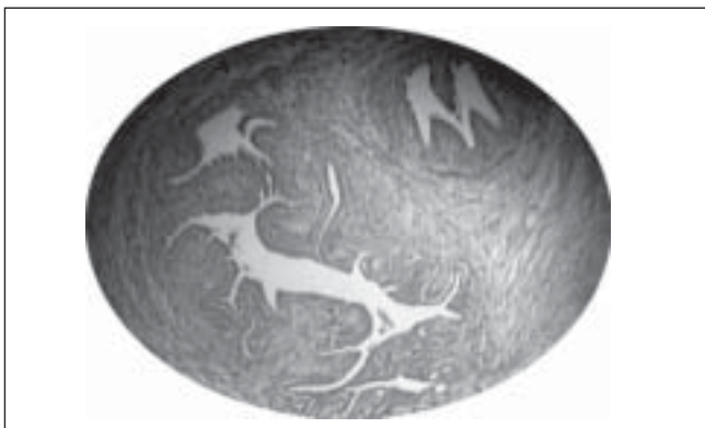
Figure 2: Cysticercosis - Scolex and epithelium lined tortuous body canal continuous with outer cystic layer

Clinical manifestations of intestinal infection by Taenia solium could be asymptomatic or may present with epigastric pain, nausea and loose motions. In cysticercosis manifestations are different and depends on the location of cysticercosis in the body, not only this but also the number of cysticercosis at a particular site and the associated inflammatory response or scarring decides the clinical presentation. In 87% of cases cysticercosis presents as solitary lesion. Presentation as subcutaneous nodule on trunk, upper arm, eyes, neck, tongue, face and breast has been reported in this order of frequency. Neurocysticercosis is most often presented with seizures and may be associated with subcutaneous nodules comprised of extraneural cysts.