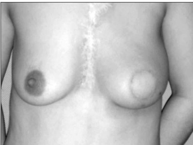
Figure 2a: Post operative 18th month view of patient No: 15 whose left breast reconstructed immediately. She had both radiation therapy and chemotherapy and a radiation burn occurred in the sternal area.