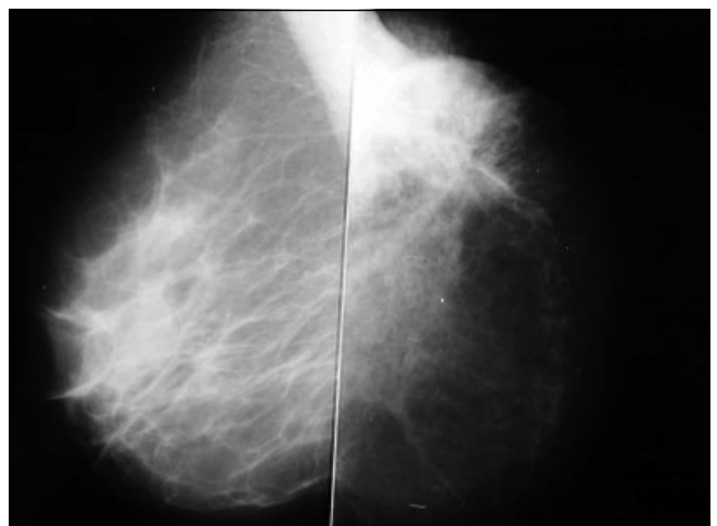
Figure 3b: Mediolateral mammogram of the breasts.