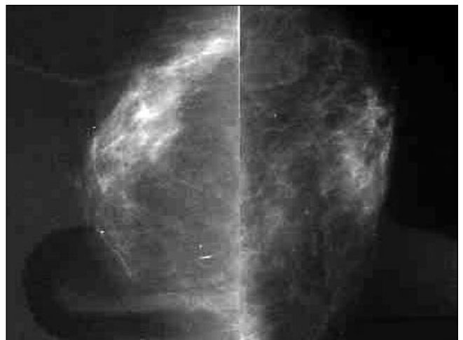
Figure 2b: Mediolateral mammogram of the breasts.