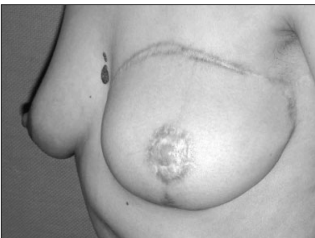
Figure 3a: Post operative 20th month view of patient No: 12 whose left breast reconstructed two years after mastectomy.