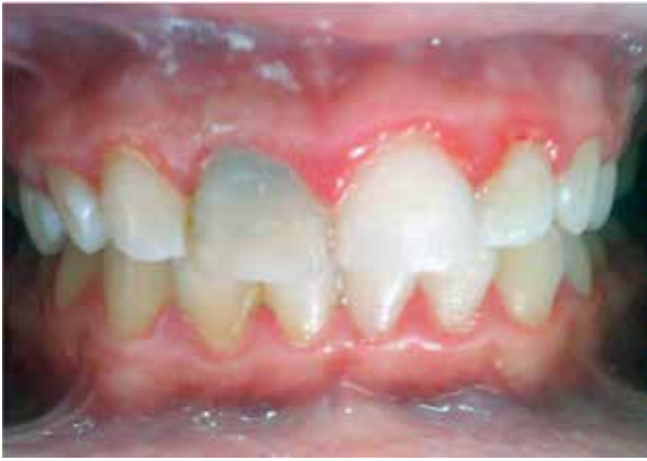
Figure 8. Intraoral photograph at 2011 follow-up of Case 2. Note severe discoloration in the right incisor.

of treatment. Discoloration effect of gray MTA as a pulpotomy agent in the crowns was shown and white MTA was developed because of this clinical complication. However, significant tooth discoloration was also reported after the use of white MTA. 23 Belobrov and Parashos 23 observed that most of the discoloration was inside white MTA and did not penetrate into dentin. They questioned and did not encourage the use of white MTA for vital therapy in the esthetic zone. Lenherr et al 24 asserted that the infiltration of blood components into the porosities within MTA may be the prime cause of discoloration. The other possible reasons for tooth discoloration may be bismuth oxide, magnesium oxide and ferric oxide ingredients in MTA powder. 25,26