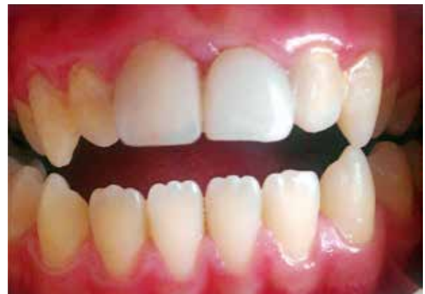
Figure 5. Intraoral photograph after renewal of composite restorations of Cases 5 and 6 at 2012.