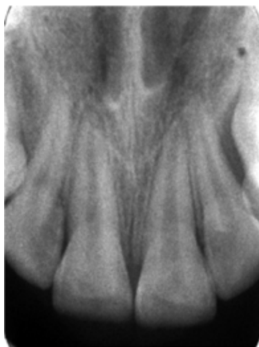
Figure 6. Preoperative radiograph of Case 2 (right central incisor). Note that the left central incisor had also crown fracture