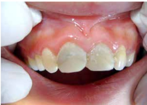
Figure 4. 2012 Control radiograph of Case 5 after apexification and root canal treatment. Note the uncertain periapical healing around Case 5.

In all six cases, gray MTA caused severe discoloration in the tooth crowns. Such a complication following pulpotomy specifically in the anterior teeth should be accounted as a clinical failure