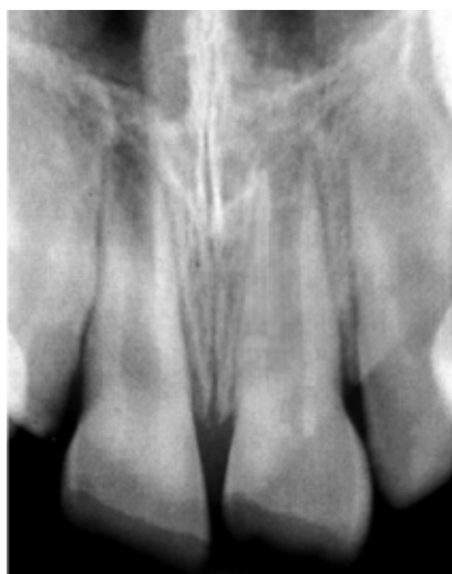
Figure 1. Preoperative radiograph of Case 5 (right central incisor) and Case 6 (left central incisor).

There are several MTA pulpotomy case reports involving immature root formation in the lit-