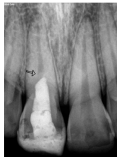
Figure 7. 2011 follow-up radiograph of Case 2. Note complete root formation and evident dentin bridge formation beneath MTA (arrow).