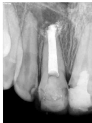
Figure 3. 2012 Control radiograph of Case 5 after apexification and root canal treatment. Note the uncertain healing around Case 5.