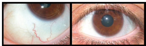
Figure 3. Clinical view of resolution of scleritis 4 months after periodontal therapy.

Her doctor advised to use oral non steroidal anti-inflammatory drugs and later ophthalmologic steroid solutions. However, these treatments failed to control the progression of the disease, and the symptoms of scleritis sometimes decreased then increased again. A year after the initial diagnosis, she was referred to the Periodontology department. After periodontal examination, deep periodontal pockets and serious bone loss was detected radiographically (Figure 2). The diagnosis was generalized as chronic periodontitis. Flap procedure was performed in 3 quadrants (right and left maxillary quadrants and left mandibular quadrant), and the maxillary right second premolar, maxillary left third molar, and mandibular left second premolar teeth were extracted due to the serious bone loss. Additionally, the mandibular left third molar was also extracted. After a healing period, scleritis was resulted in rapid resolution (Figure 3). The patient was re-evaluated after 6 months and no recurrence in scleritis or periodontitis was detected.