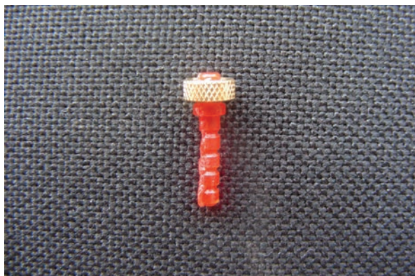
Figure 4. Metal O-ring fitting well to the resin post.

7). The metal O-ring was placed on the laboratory analogues on the master cast and a record base was fabricated. A relief block-out was performed around the attachment for easy removal of the record base. A record rim was made and the jaw relationship recorded using conventional techniques. Teeth arrangement was done and a trial was made. After a satisfactory trial, the trial denture was invested and dewaxed. The metal O-rings were retrieved from the temporary record base and were placed on the abutment analogue (Figure 8). Block out was performed beneath the O-ring. Heat polymerizing acrylic resin was packed and cured. Finishing and polishing of the processed denture were carried out. Relief was provided around the O ring and bar framework area so that no movement of the framework occurred as the denture base was moved slightly on and off the tissues (Figure 9). Fit checker disclosing agent was used for this purpose to identify contact between the attachment mechanisms and the denture base. Finally the denture was placed (Figure