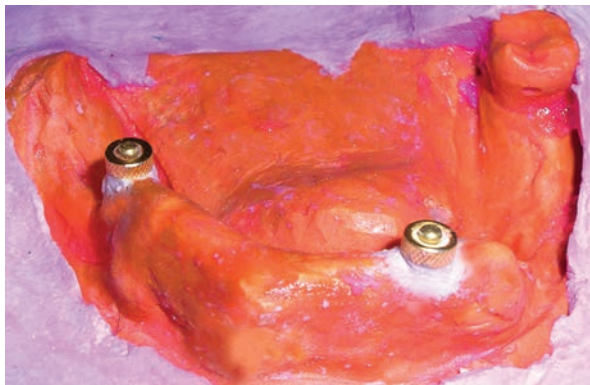
Figure 8. Wax elimination complete and the O-rings placed on the laboratory analogues.