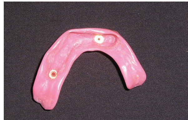
Figure 9. Tissue surface of the denture showing the embedded female attachments.