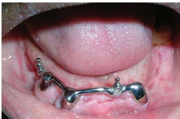
Figure 6. Cemented bar framework.

Tooth-borne overdenture bar attachment therapy is a treatment option rarely chosen in today's aggressive marketing of implant treatment. 14 Most of the reported cases in the literature on the combination of bar and O-ring attachment overdentures are implant supported. 15,16 In the reported