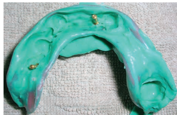
Figure 7. Final impression for the denture fabrication.