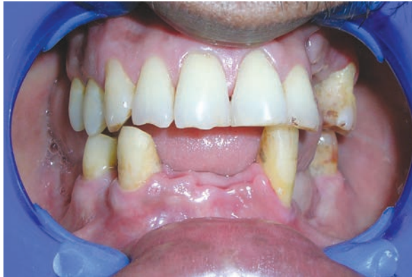
Figure 1. Image of patient's remaining firm teeth.

After the cementation of the bar framework, a final impression of the lower arch was made using medium body rubber base material. Care was taken to block the undercuts below the bar with soft wax at the time of impression making. Brass abutment analogues which were previously used for duplication were placed in the impression and a master cast was poured in dental stone (Figure