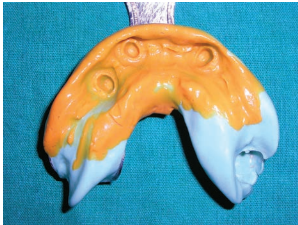
Figure 2. Rubber base impression after tooth preparation for bar framework fabrication.