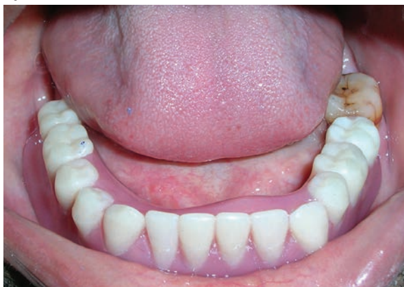
Figure 10. Prosthesis in-situ .