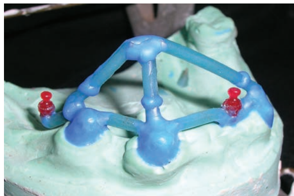
Figure 5. Wax pattern of the bar framework with the duplicated resin studs attached.