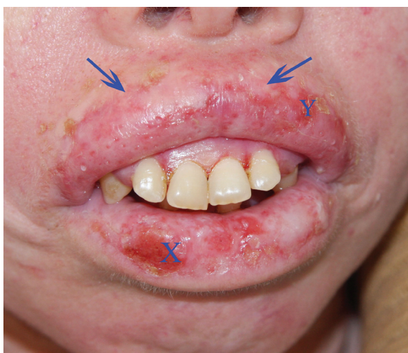
Figure 2. Actinic cheilitis of the upper and lower lips. Incisional biopsies were taken from the areas marked as X and Y. The arrows show the extension of the lesions beyond the vermillion-cutaneous margins.

and infection of the lip by the human papillomavirus may cause additional cytogenetic alterations and further increase the risk of actinic cheilitis becoming carcinomatous. 13