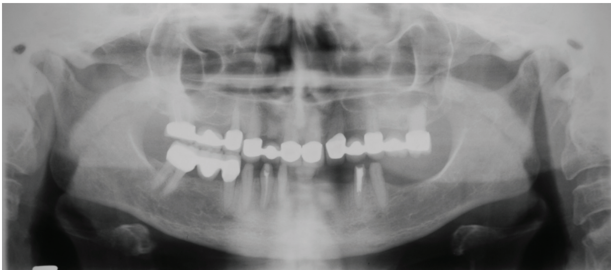
Figure 2. Example of category C2 of the mandibular cortex index.