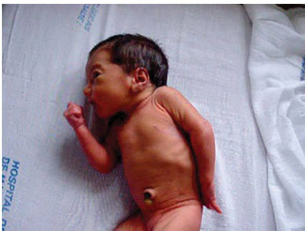
Fig. 2 Erb's obstetric paralysis.

roots; and low palsy, or Klumpke (C8-T1), in which the forearm and hand muscles are the most affected. The severity of the injury depends on the affected roots and its extent.