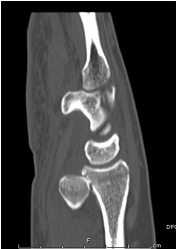
Fig. 4 CT Scan at 4 months.