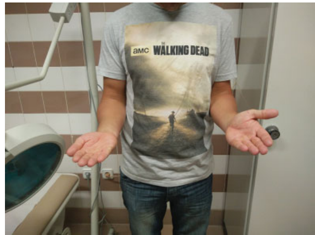
Fig. 6 Final clinical result.