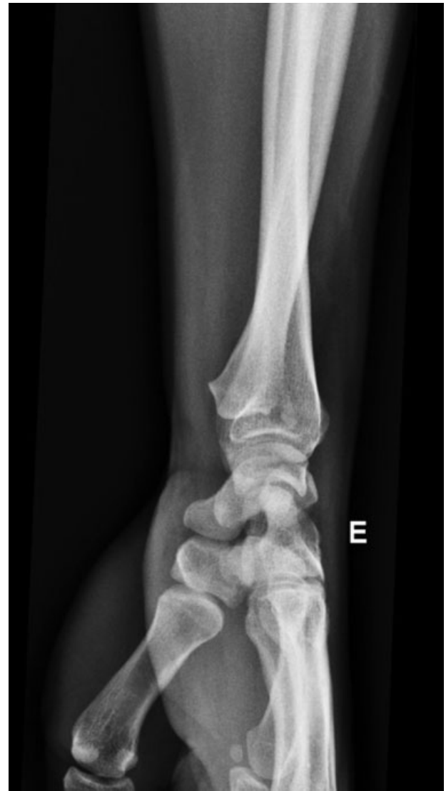
Fig. 2 Initial X-ray - Lateral View.

pronation was found to be complete and stable, but every attempt at supination resulted in a new volar dislocation of the ulnar head. The TFCC had ruptured from the fovea, and was fixed to it with a bone anchor. The dorsal capsule was closed and reinforced with a plicature. The DRUJ was temporarily fixed with two Kirschner wires in neutral position. The patient was immobilized with a cast and splint below the elbow. After two weeks, the sutures were removed, and full flexion and extension of the wrist and elbow were allowed. A block of the pronation and supination was maintained until 7 weeks after surgery, when the Kirschner wires were removed. Then the patient was allowed to perform full pronation, but used a dynamic splint that would block supination. Then, he initiated the rehabilitation. Twelve weeks after surgery, total range of movement was allowed.