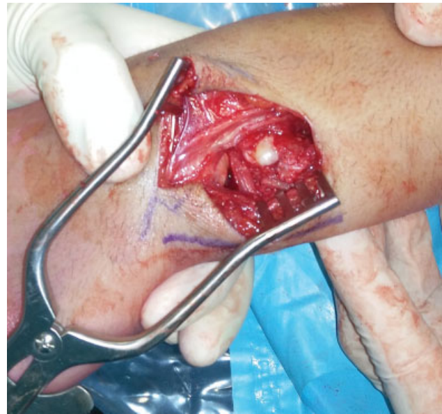
Fig. 5 Dorsal approach to the DRUJ.