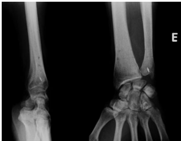
Fig. 7 Final X-ray.

dislocations. Two of these were dorsal dislocations, one was a volar dislocation, and all were treated with closed reduction and pinning.