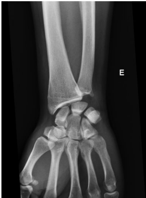
Fig. 1 Initial X-ray - AP View.

A closed reduction was attempted with no success. Surgical treatment was performed. A dorsal approach through the 5th compartment was performed, as described by Garcia-Elias et al. 3 An open reduction of the dislocation was performed (►Fig. 5). The ulnar styloid fracture reduced spontaneously after the reduction of the DRUJ. After the reduction, the