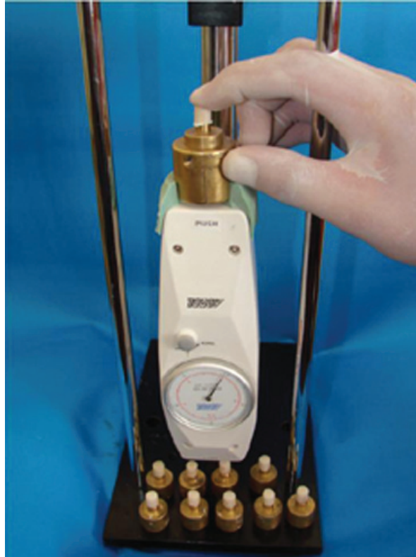
Figure 2. Special pressure device to apply standard cementation force during setting of cement.