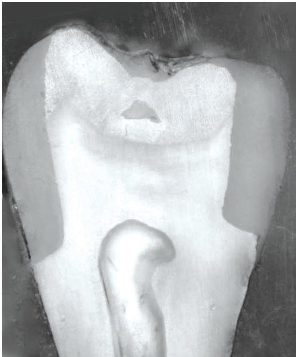
Figure 1. Dye penetration at dentin in non-thermocycled and non-loaded teeth.

The very low scores of the occlusal microleakage observed in this study are in agreement with several other studies, especially with those in which newly developed adhesive systems were used. The proper occlusal seal of both restorative materials, even in thermocycled and loaded groups, indicates that the ormocer Admira and the hybrid composite TPH Spectrum exhibit a good adaptation to sound enamel margins even with a bevel of approximately 0.5 mm. It has been reported that a thin composite material in bevelled occlusal enamel margins could be prone