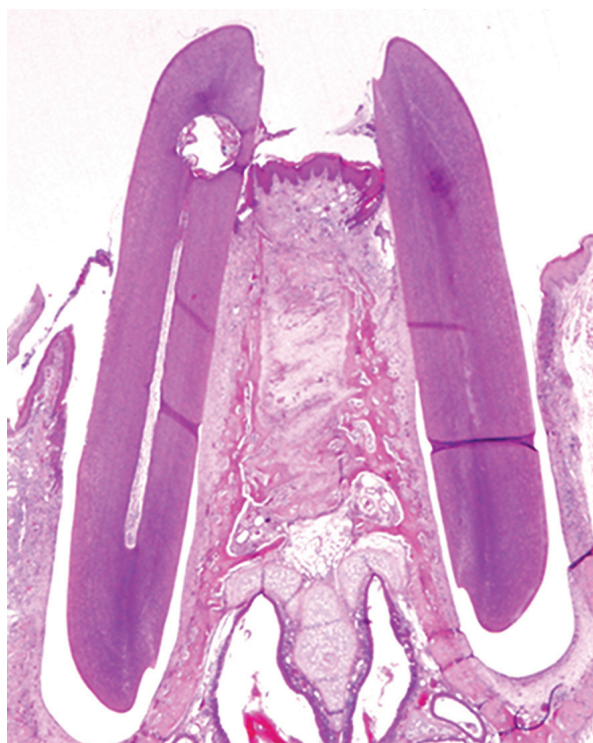
Figure 2. A histological section (4X magnification) that histomorphometric evaluations were done.

All data were analyzed with the statistical package for social sciences, 13.0 (SPSS for Windows, SPSS Inc, Chicago, Illinois, USA). Descriptive statistics are given as mean, standard deviation, standard error, minimum and maximum. The group differences were studied by the Mann-Whitney-U test (with the Bonferroni correction). P-values less than .05 were evaluated as statistically significant.