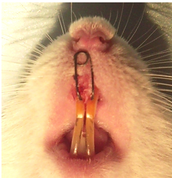
Figure 1. Appliance in situ.

ED-71 [1 \alpha ,25-dihydroxy-2 \beta -(3-hydroxypropoxy) vitamin D3] obtained from Chugai Pharmaceutical Co., LTD (Tokyo, Japan), were dissolved in propylene glycol. In this histomorphometric study, experimental group was treated with single dose of ED-71 (0.8 \mu g/kg body weight) and eight control animals received vehicle solution. Twenty-four hours after expansion, one dose 10 \mu l ED-71 or vehicle solutions was injected into the mid-palatal suture with a micro-syringe (Hamilton Injection syringe, Hamilton Company, Nevada, USA).