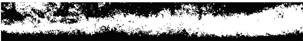
Figure 3. Binary form of the ROI.