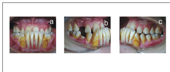
Figure 5. Intraoral view of case at 3 months after surgery.