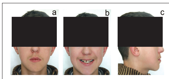
Figure 1. Extraoral view of case.