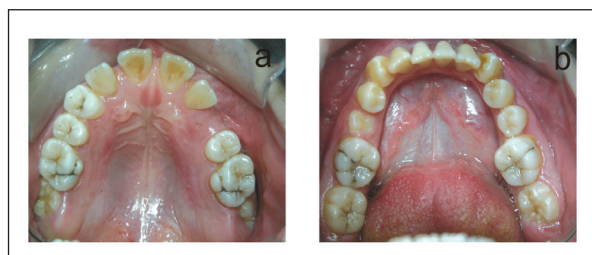
Figure 2. Intraoral upper and lower occlusal view of case.