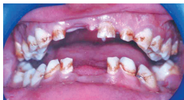
Figure 6. Intraoral view of patient is showing gingivae and erupted teeth (Case 3).