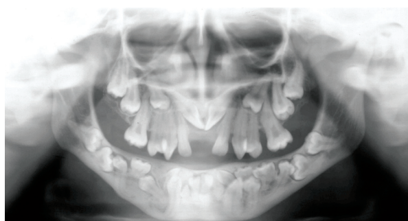
Figure 5. Panoramic radiograph is showing that multiple impacted teeth, ectopic teeth and some dental crown-root abnormalities are in maxilla and mandible (Case 2).

Intraoral examination revealed that the patient's maxilla and mandible were partially edentulous with the following erupted teeth (Figure 6):