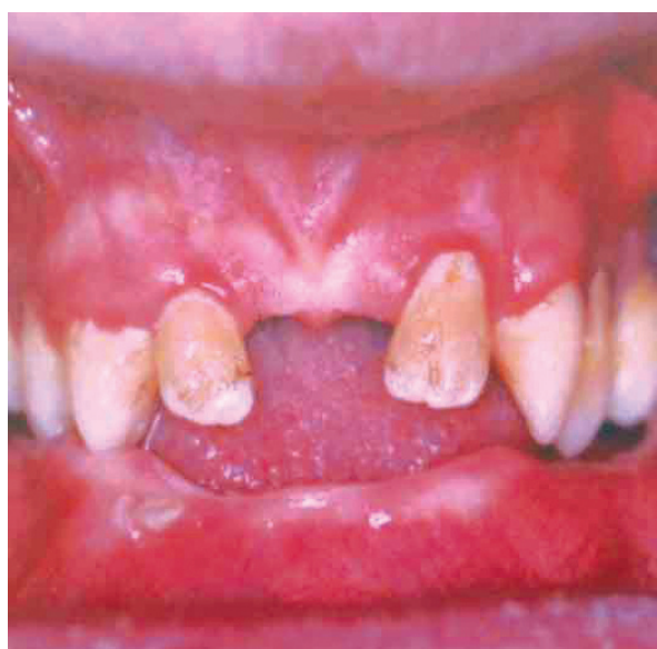
Figure 4. Intraoral view of patient is showing totally clinically edentulous mandible (Case 2).