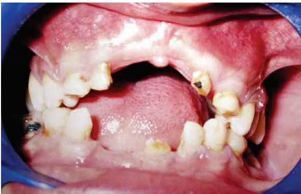
Figure 1. Intraoral view of patient is showing fully and partially erupted teeth and gingivae (Case 1).

During the general examination, a height of 165 cm and a weight of 55 kg were registered. The circumference of the head was measured as 49 cm. None of these measurements deviated from the norm. There were epichantus on his eyes and his ear lobes were stuck. Ophthalmological and neurological examination of the patient revealed no pathological symptoms. Intelligence was subjectively normal. Liver and spleen were not palpable. Radiologically, clavicles, vertebral skeleton, chest, skull, hands and feet were normal. CT scan of the paranasal sinus evaluations showed frontal sinus agenesis and maxillary sinus hypoplasia (Figure 3). Results of routine hematology tests and karyotyping (46, XY) were normal. There was no significant medical or dental history of the patient's family.