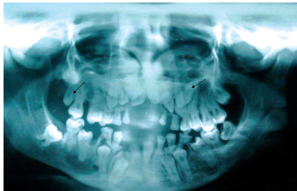
Figure 2. Panoramic radiograph is showing unerupted teeth and supernumerary teeth (marked with arrows) (Case 1).