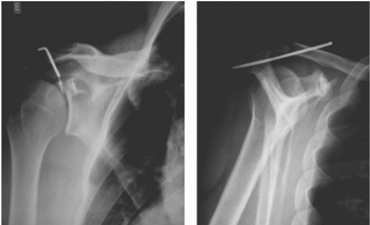
Fig. 2 Postoperative anteroposterior (AP) radiograph of the shoulder and profile of the scapula in the postoperative period, showing the anchors in the coracoid process and the temporary fixation Kirschner wire between the clavicle and the scapular spine.

buried under the fascia, and the final closure by layers was performed.