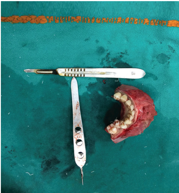
Fig. 3 Intraoperative picture showing excised specimen.