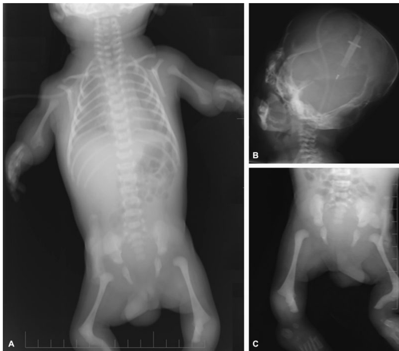
Fig. 2 Radiographic evaluation showing 11 ribs and shortened and deformed humerus (A); marked deformity of the skull with reduction of its anteroposterior diameter (B), and femur bending, with absence of tibia and fibula (C).