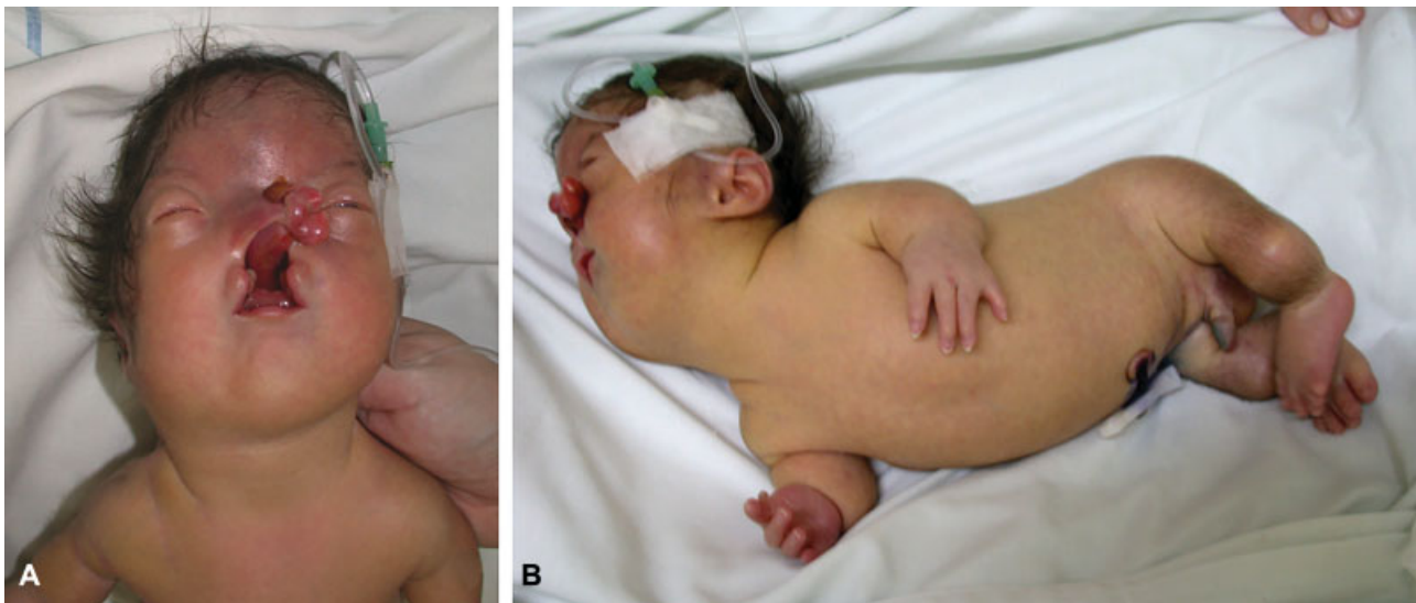
Fig. 1 Patient at 2 days of age. Note orbital hypertelorism and facial cleft involving the nose, lip, and palate with the presence of a nasal rudiment (A); small, low-set, and posteriorly rotated ears; drastic shortening of the arm and forearm along with small hands with absence of thumb on the left side and presence of an appendicular thumb on the right, and remarkable shortening of thighs and legs (B).

In our literature review in MEDLINE, we found only one Brazilian study involving individuals with RS. Barbosa et al evaluated the replication patterns of homologous aliphoid