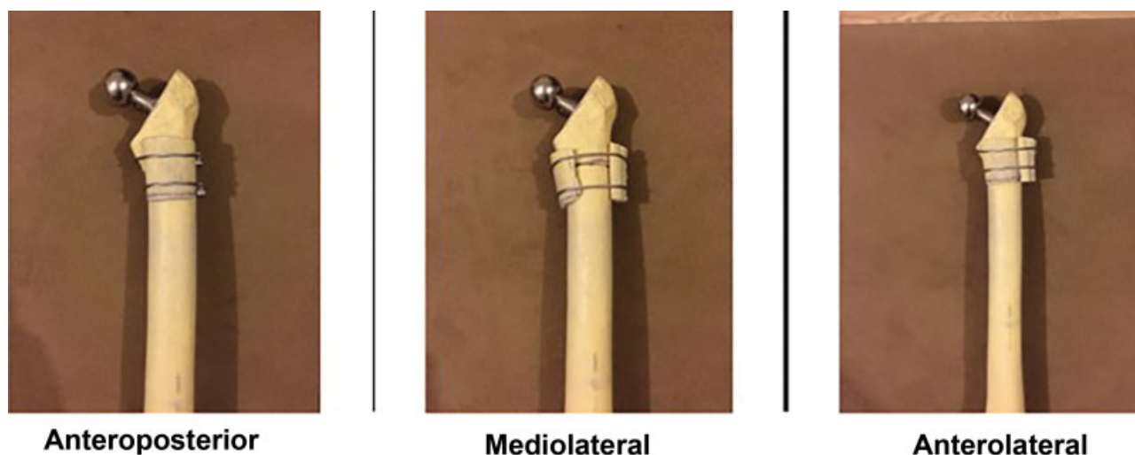
Fig. 1 Positions of the graft: anteroposterior, mediolateral and anterolateral.

anteroposteriorly, mediolaterally and anterolaterally, centering the osteotomy side, and fixed with cables around each composite bone (►Fig. 1). This procedure was repeated for each bone according to the type of osteotomy of the group.