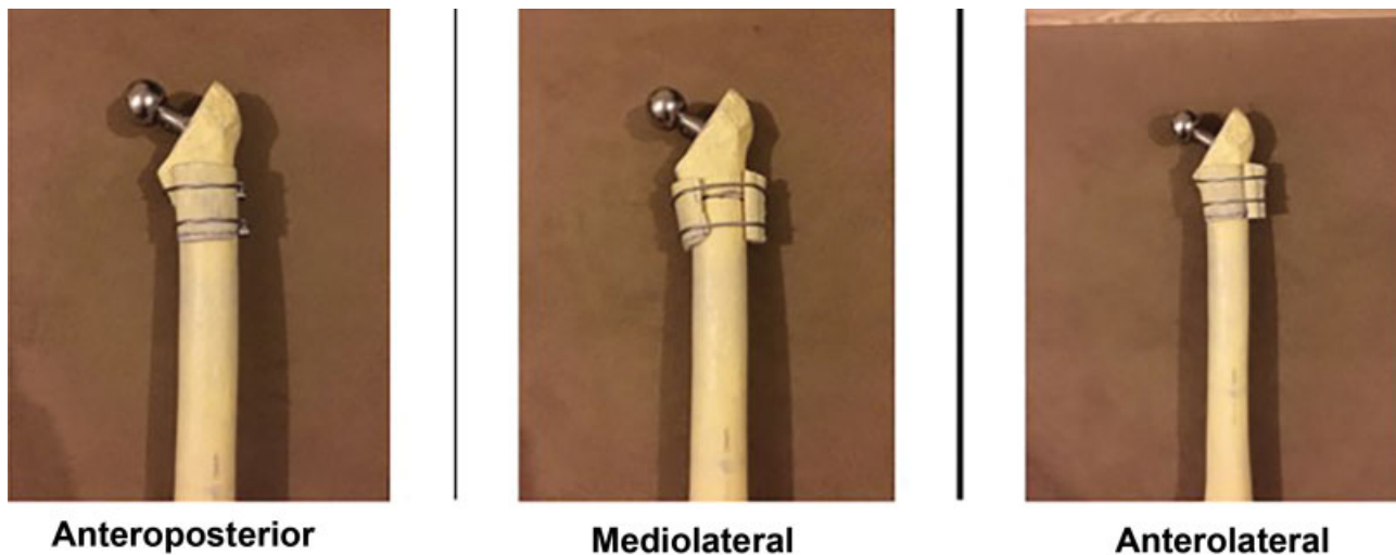
Fig. 1 Positions of the graft: anteroposterior, mediolateral and anterolateral.

anteroposteriorly, mediolaterally and anterolaterally, centering the osteotomy side, and fixed with cables around each composite bone (► Fig. 1 ). This procedure was repeated for each bone according to the type of osteotomy of the group.