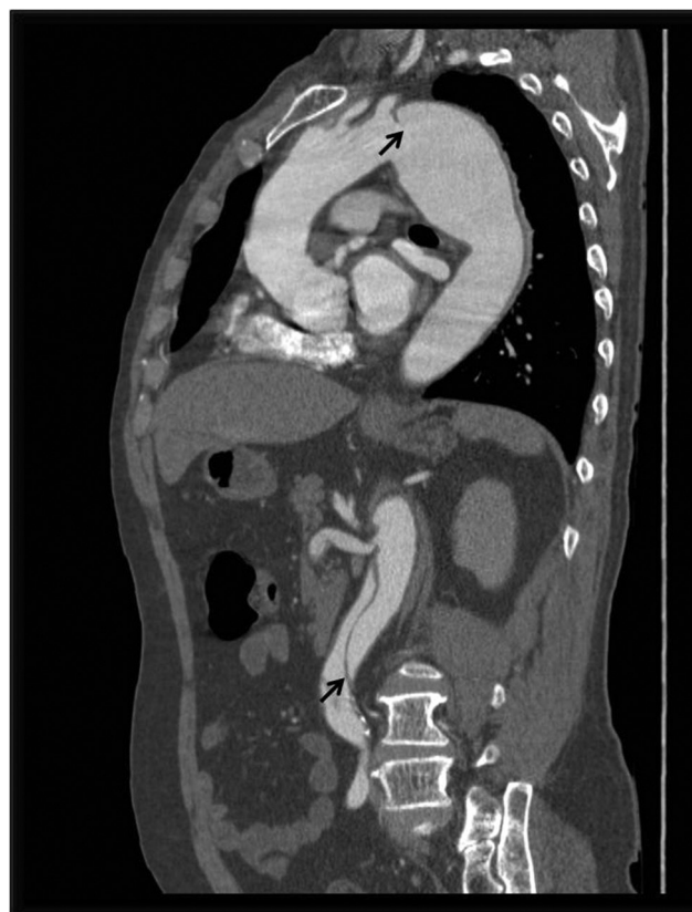
Fig. 1 Sagittal oblique image of the CT angiogram showing the type B dissection with the dissection flap (black arrows) in the descending thoracic and abdominal aorta.

A 42-year-old man with no prior cardiovascular comorbidities presented with acute severe chest pain and history of dyspnea for the past 6 months. Routine blood investigations were normal with normal levels of cardiac biomarkers. Preliminary echocardiography performed in the emergency room showed aortic regurgitation with a dissection flap in the visualized descending aorta. Emergency computed tomographic (CT) angiography showed a type B aortic dissection, with pseudoaneurysm formation at the proximal descending thoracic aorta (►Fig. 1). In view of continuing severe chest pain and false lumen pseudoaneurysm, decision was taken for endovascular stent graft placement to cover the entry tear. In the angiography suite, after the initial aortic angiograms for planning the device placement, the patient suddenly developed drowsiness and responded to commands with incomprehensible words. Doppler evaluation of the carotid arteries was performed and was normal. Without further delay, the patient was intubated and the procedure was completed (►Figs. 2, 3). The total amount of iodinated contrast (nonionic) used in the procedure was 300 mL. On extubation, the patient was still found to be drowsy with incomprehensible sounds. Noncontrast CT of the head was performed, which showed focal cortical edema and sulcal hyperdensities in the left high frontal lobe and parietal lobe (►Fig. 4). The patient was closely observed, and his symptoms resolved after 36 hours.