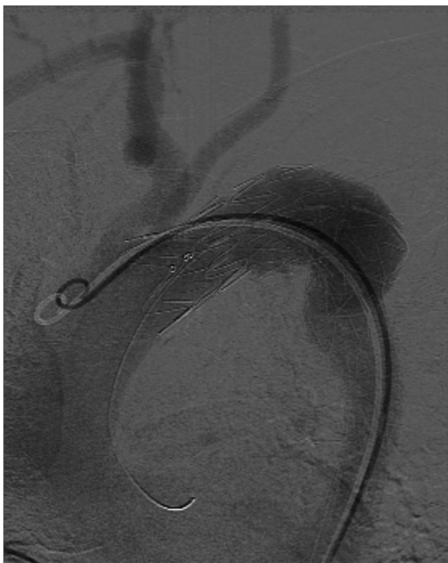
Fig. 3 Angiographic image post stent graft deployment showing absence of filling of the false lumen and no flow in the left subclavian artery (covered by the stent graft).