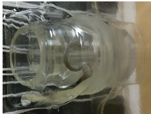
Fig. 2 Over-the-scope clip with rounded teeth loaded on over-the-scope clip applicator cap. The applicator cap has to be mounted on the tip of the endoscope.

An 84-year-old woman presented right upper quadrant pain for two days without any history of fever. The patient had a history of stroke for which she was taking dabigatran etexilate mesylate and had undergone laparoscopic cholecystectomy for gallbladder stones previously. Examination revealed icterus and tenderness on deep palpation in