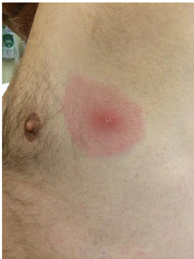
Fig. 1 Targetoid rash or erythema migrans, seen in early cutaneous Lyme disease.

Lyme disease is a systemic illness caused by the Ixodes tick-borne spirochetes Borrelia burgdorferi , Borrelia garinii , and Borrelia afzelii . 30 The systemic syndrome is often heralded by the classic erythema migrans or targetoid rash (► Fig. 1) at