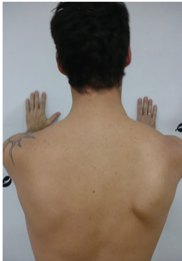
Fig. 3 Clinical image of a winged scapula.

The malignant transformation of the osteochondroma is uncommon. In solitary forms, it occurs in approximately 2% of the cases and, in multiple forms, around 27%. 16 The literature highlights that the thickness of the cartilaginous layer is a predictive factor for aggressiveness, that is, a thickness higher than 2.0 cm is a strong indicator of malig-