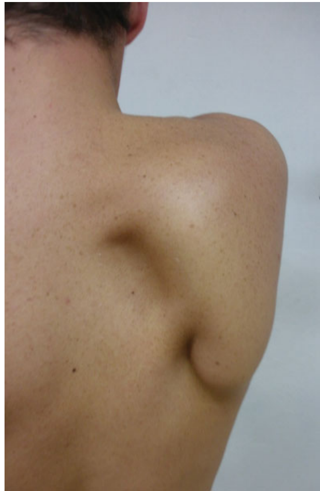
Fig. 2 Clinical image of a subscapular osteochondroma.

Its presence, and, therefore, its diagnosis is noted due to the growth and increased volume in the scapular region at ectoscopy. Clinical manifestations, such as local pain, are usually delayed and may be secondary to neurovascular structures compression, bursa thickening (when present), peduncle fracture, or malignant transformation. Other symptoms, such as scapular protuberance, crepitation, edema, and loss of mobility, may be present depending on the