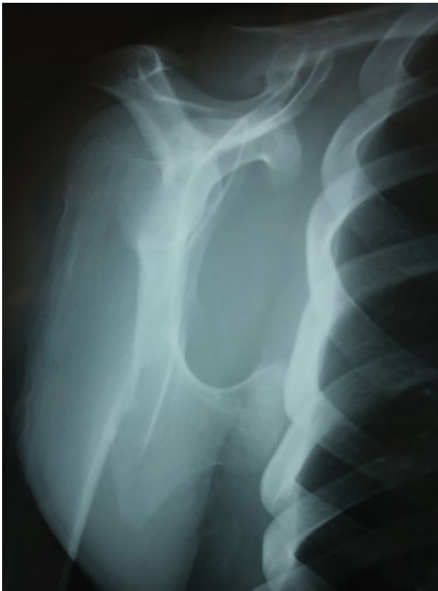
Fig. 1 Axial radiograph of the scapula showing an osteochondroma in the middle third of its anterior aspect.

Osteochondroma is the most common benign tumor in the metaphyseal region of long bones and rarely affects flat bones; however, it is the most frequent benign tumor in the scapula. 2,3