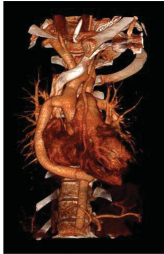
Fig. 3 Postoperative computed tomography scan showing patent extra-anatomic conduit coursing along the right heart border.

For these reasons, we decided to treat the patient by means of extra-anatomic aortic bypass. In this way, we were able to relieve the obstruction while working far from the coarctation site. Our experience confirms the safety and