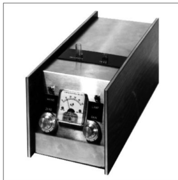
Fig. 2 The first Born aggregometer. The instrument equipped with a stirring device and galvanometer was presented during a workshop at the Royal College of Surgeons in 1961. Of note, changes in the optical density had to be read and subsequently plotted manually (→ Fig. 3). (taken from Born 14 and reproduced with permission of the Born family).

Being asked that question in an interview by Rod Flower, Gustav laughed and replied: 'That's the only useful thing that came out of my DPhil in Oxford. There we had measured ribonuclease activity in Streptomyces culture filtrates turbidimetrically pushing light through suspension. Well, and then I thought that would be ideal for platelets'. 5 Using a rather simple device (→ Fig. 2) in this method, a light beam is passed through anticoagulated platelet-rich plasma (PRP). When platelets are induced to aggregate, the optical density of PRP decreases and light transmission increases. Of note, using the same principle, John O'Brien almost concurrently published a two-part paper on platelet aggregation measure-