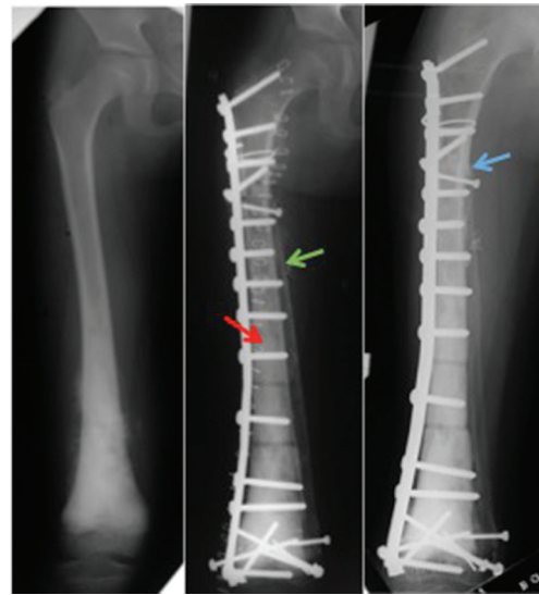
Fig. 2 Vascularized fibular graft (green arrow) with autoclaved bone graft (red arrow) and plate fixation in a patient with osteosarcoma of the distal femur. Evidence of union between native femur, autoclaved bone graft, and vascularized bone graft (blue arrow) on 1 year follow-up.

Given that the survival of segmental endoprostheses is a concern (10-year survival rates of segmental endoprostheses