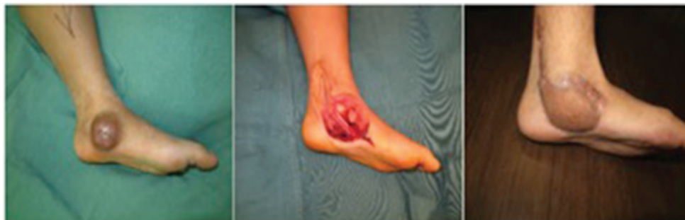
Fig. 3 Patient with clear cell sarcoma of the foot, who underwent resection and immediate free lateral arm flap coverage of the defect.

The advantage of a free flap is that the surgeon can perform a resection with optimal margins, allowing for better local control. Examples of commonly used free flap options include latissimus dorsi, serratus anterior, gracilis, anterolateral thigh, anteromedial thigh, lateral arm, and radial forearm flap. Proponents of free flaps argue that pedicled flaps do not provide sufficient coverage and may introduce a further plane to the dissemination of disease. In a single center study by Cordeiro et al, where 59 free flaps were performed following oncologic resection, of which 35 patients underwent adjuvant therapy; it showed similar complications to free flaps used for other indications. 47 This shows that free flaps are a reliable option for oncological reconstruction. ► Fig. 3 demonstrates an example of a patient with sarcoma of the foot undergoing resection and immediate coverage with a free lateral arm flap.