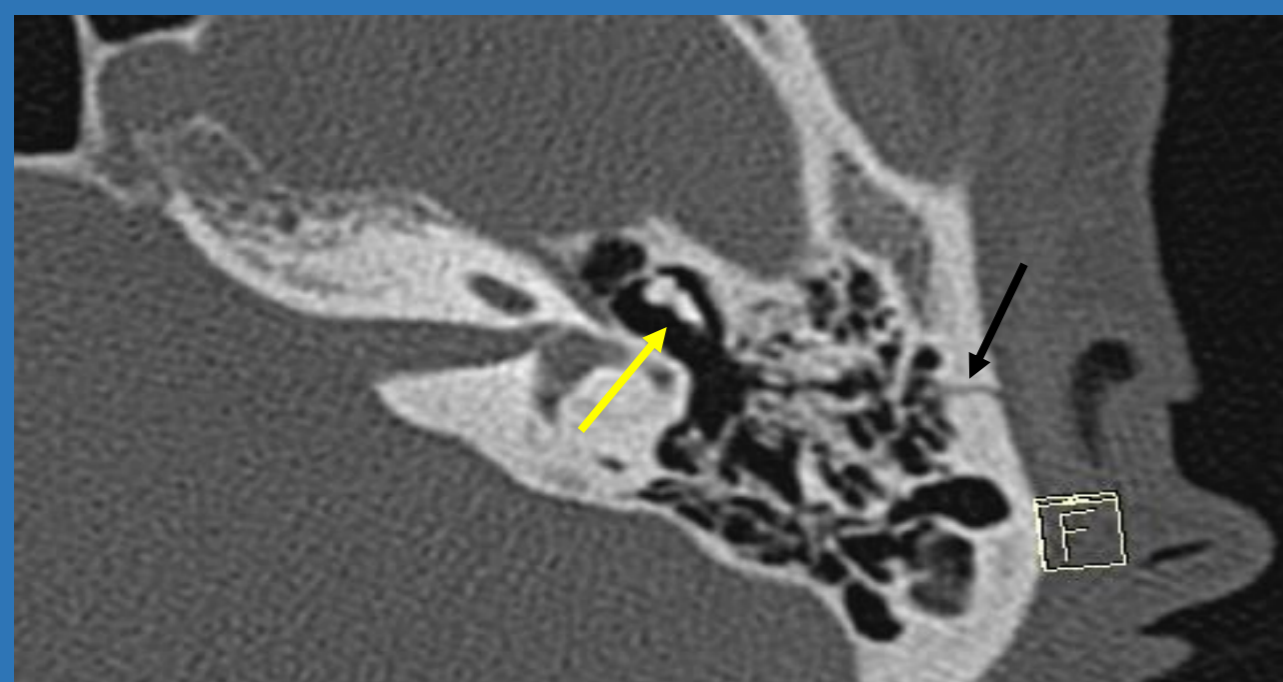
Fig.1. Cone beam computed tomography showing the fracture line of the left temporal bone (black arrow). The yellow arrow displays the incus and malleus, which normally resemble a scoop of ice cream in a cone.

A 42-year-old male presented with long standing conductive hearing loss some 3 months after a head injury. The audiogram revealed an air-bone gap of 46 dB on the diseased side. Pure-tone air and bone conduction thresholds were 76 dB and 30 dB, respectively. Cone beam computed tomography (CT) detected an atypical fracture of the left temporal bone, communicating with the left external ear canal. (Fig.1) The 3D visualization with CT virtual endoscopy suggested injury in the area of the stapes.