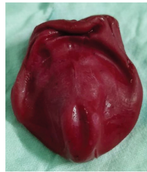
Fig. 2 Preliminary impression made with impression compound.