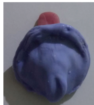
Fig. 3 Secondary impression made with medium-body elastomeric impression material.

FP was checked in the patient's mouth for any overextension and impingement of the soft tissue. After that, the mother was told to feed the infant. It was observed that the child was now successfully taking the feed with the FP in the mouth, without nasal regurgitation. All the instructions about the feeding technique, cleaning and maintenance of FP and maintenance of oral hygiene were explained to the parents. The patient was recalled after 24 hours to check for