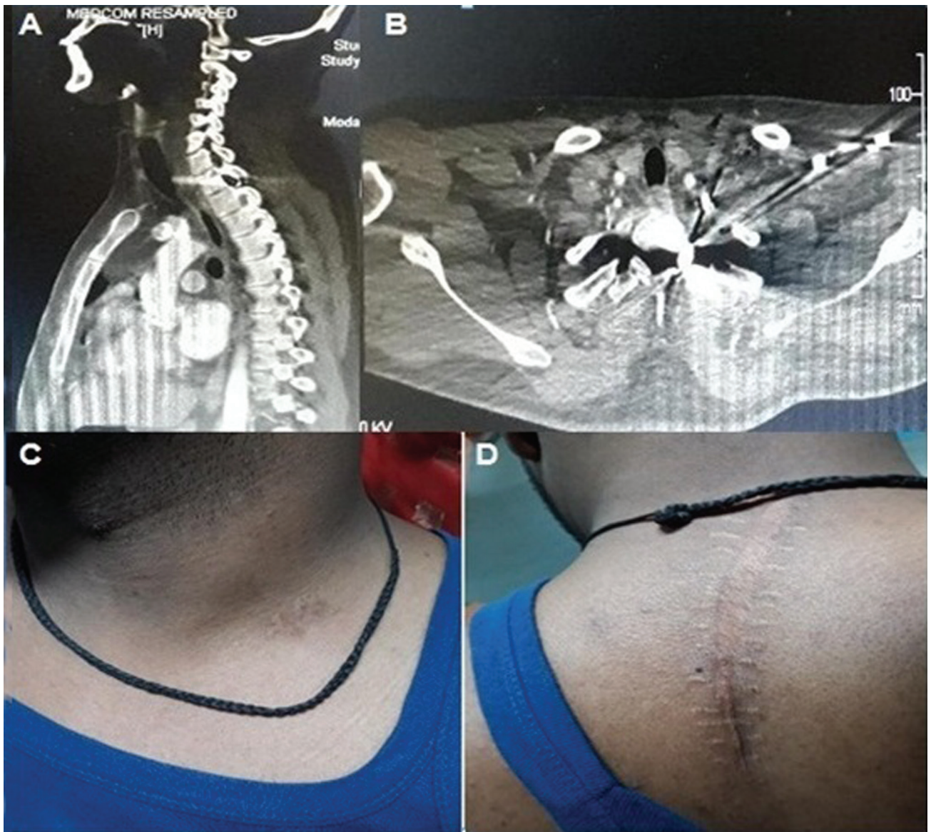
Fig. 2 (A, B) Preoperative CT scans of a patient showing fracture of left pedicle of D1 with the bullet in situ. (C) Healed entry wound. (D) Healed surgical wound.