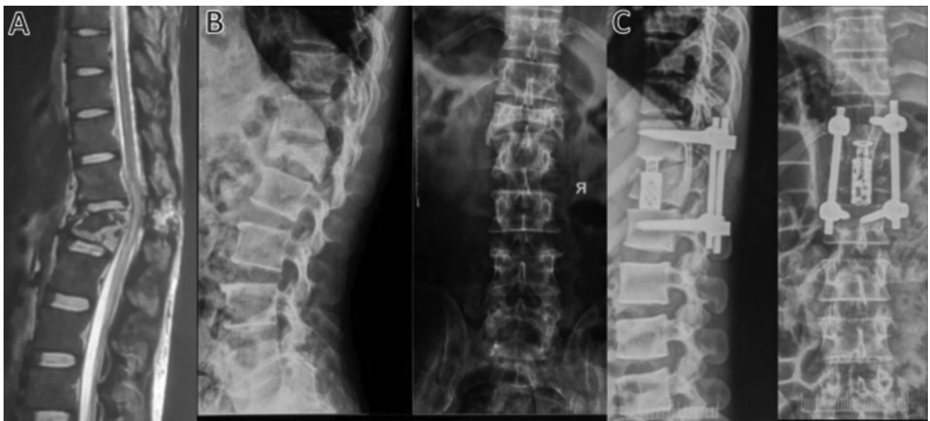
Fig. 2 Combined decompression and stabilization through posterior only approach: (A) Preoperative magnetic resonance imaging, (B) preoperative X-ray, and (C) postoperative X-ray.

operated using SSF IFS method and 12 patients were operated using LSF.