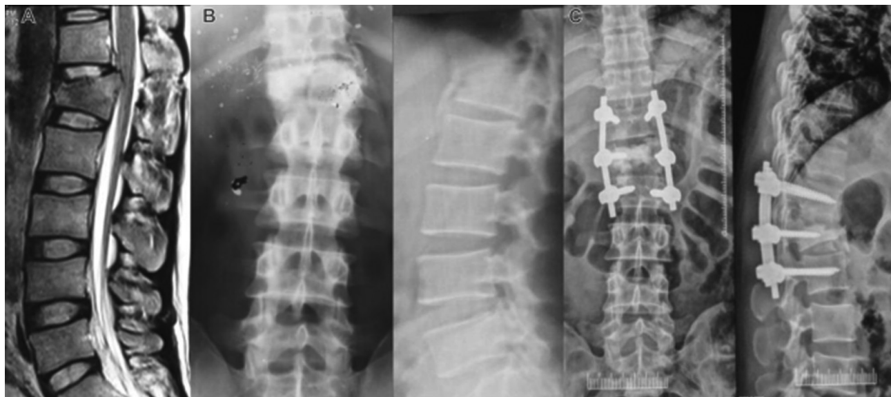
Fig. 3 Short-segment fixation including fracture segment (SSF IFS): (A) Preoperative magnetic resonance imaging, (B) preoperative X-ray, and (C) postoperative SSF IFS.