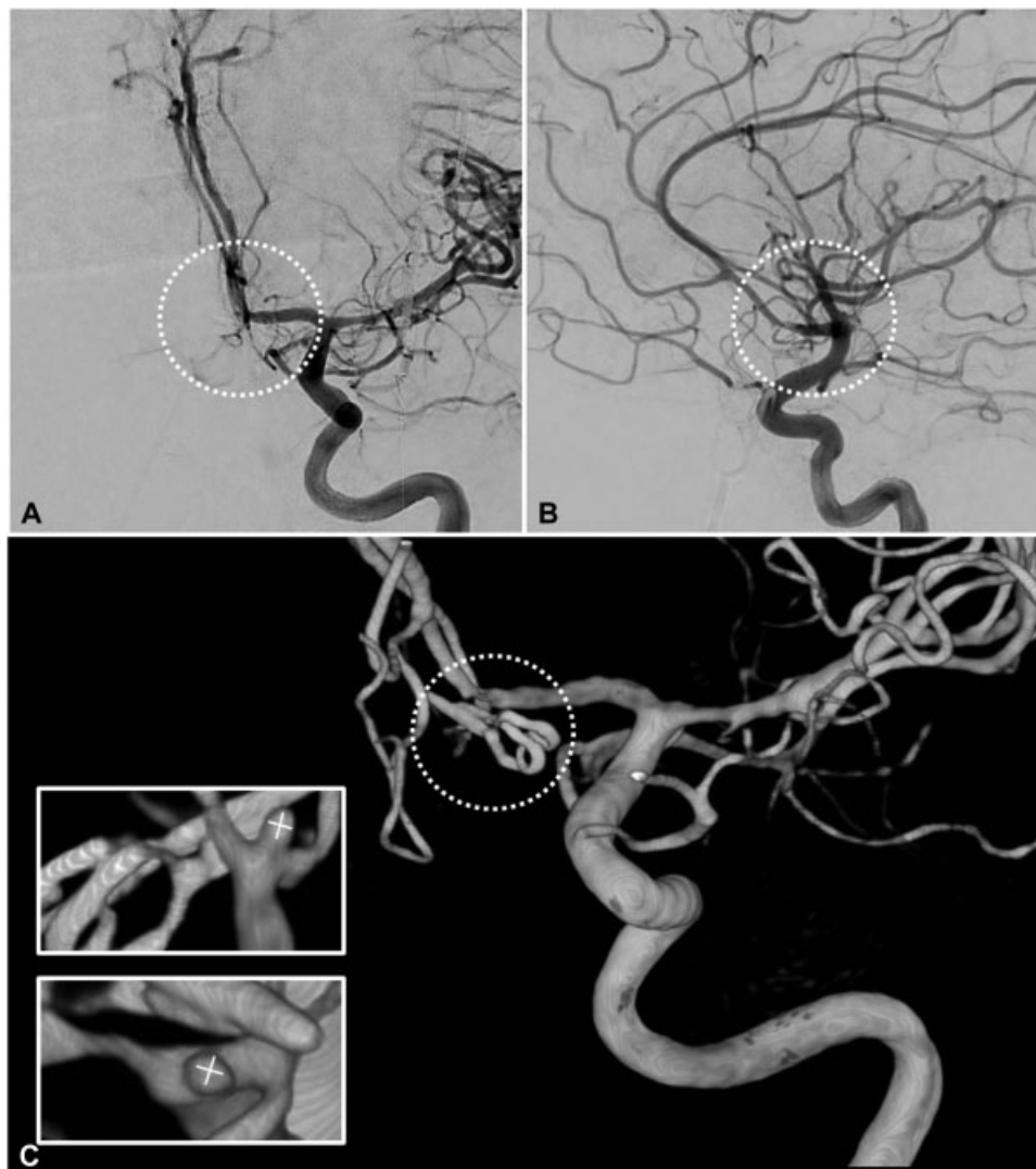
Fig. 2 Intraoperative remnant. Standard intraoperative two-dimensional digital subtraction angiography (2D-DSA) in anteroposterior (A) and lateral (B) projections shows the small remnant is barely visible and obscured by surrounding vessels. In multiplanar intraoperative 3D-DSA (C), viewing angles are unrestricted. Clipped intracranial aneurysm complex can be virtually rotated in any direction (C, inset) to identify and measure the small dog-ear remnant ( 1 \times 1.5 \times 1 mm) without interference of clip masses or adjacent vessels.

declined the planned 6-month follow-up imaging. At annual follow-up examination, angiography demonstrated a large ( 7 \times 11 mm) recurrence. With consensus of our interdisciplinary team, the patient underwent coiling of the regrown IA. At 6- and 18-month follow-up, DSA studies demonstrated complete IA occlusion ( \blacktriangleright Fig. 3).