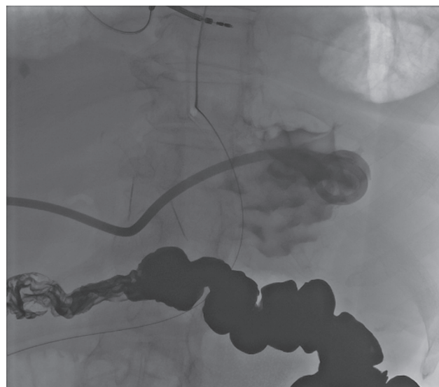
Fig. 2 A 67-year-old woman with recurrent SBO status post RYGB many years prior. Final fluoroscopic image with contrast injection via the 14F catheter demonstrates the gastrostomy to be within the excluded gastric remnant.

signs of distension or obstruction at minimum 1 year after their initial RYGB surgery. This cohort was predominantly female 9/10 (90%), with an average age of 54 \pm 14 years (range: 28–70). Median follow-up was 35.2 months after initial catheter placement (range: 0.6–115). Technical success rate for decompressive gastrostomy placement into the gastric remnant was 100% using US and fluoroscopy (►Table 1). In 2 of the 10 patients, a 12F catheter was placed. In seven cases, a 14F catheter was initially placed, although in one of these cases, the catheter was upsized to 18F due to poor function. In one case, a 16F catheter was used. Two of the 10 patients had gastropexy sutures placed during the procedure. All patients ultimately demonstrated improvement in gastric remnant distention and resolved clinical symptoms following catheter placement. In four patients, tubes were removed after 8 weeks, and patients demonstrated complete symptom